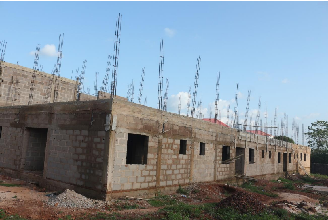
Stage of the Conference Building Before the International Conference